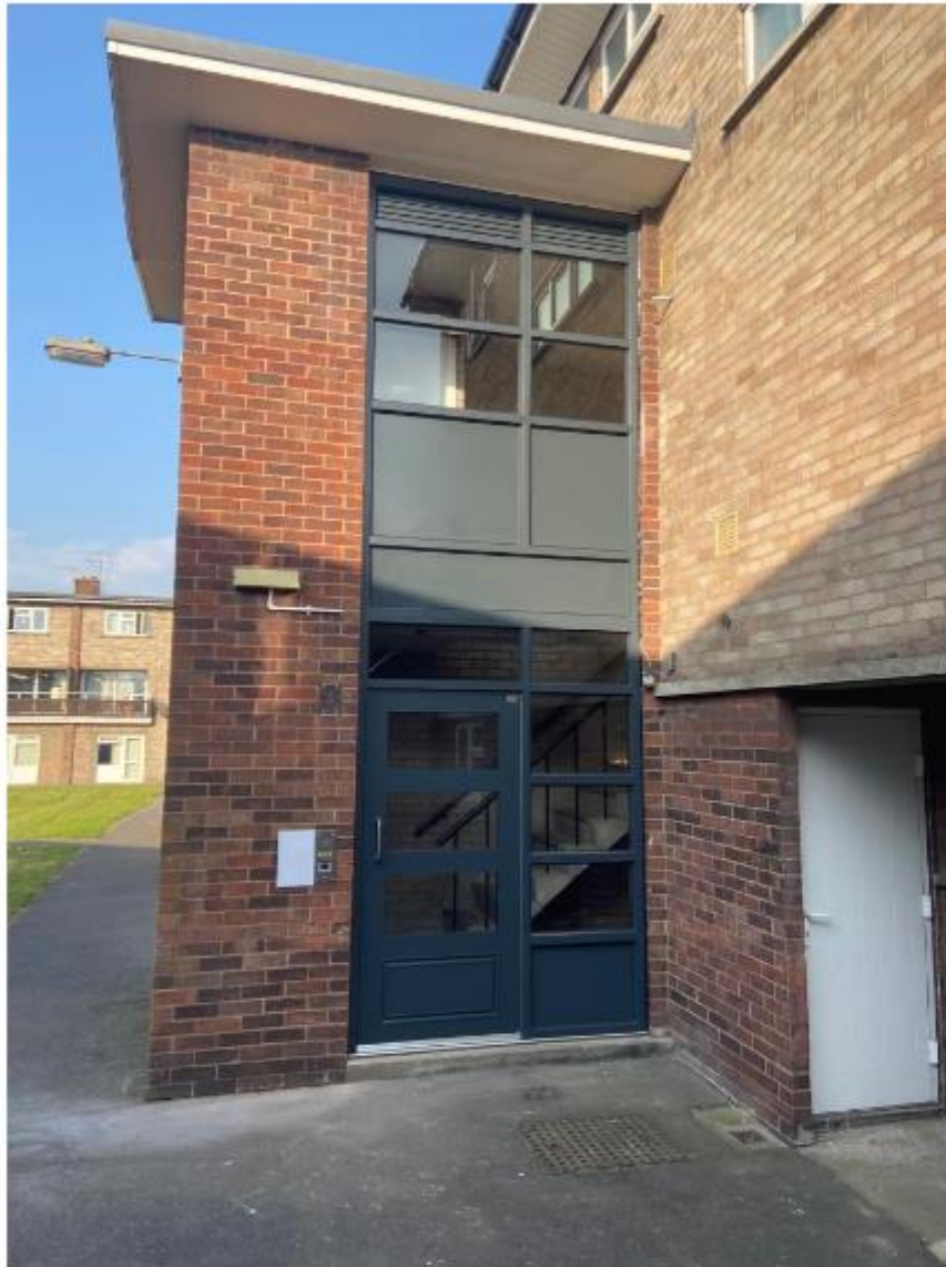
Photograph illustrating similar aluminium frame system